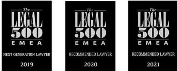
THE LEGAL 500 - RECOMMENDED LAWYER IN 2019 - 2021