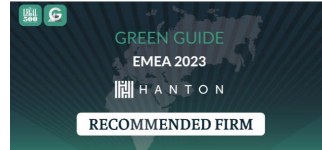
THE LEGAL 500 GREEN GUIDE - RECOMMENDED LAW FIRM IN 2023