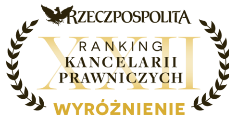
RANKING KANCELARII PRAWNICZYCH RP - RECOMMENDED LAW FIRM IN 2024 RECOMMENDED LAWYER IN 2024

+ We are proud of the awards we have received. However, what we are most pleased with, is that we maintain the constant trust of our Clients who entrust us with their most difficult and ambitious projects.